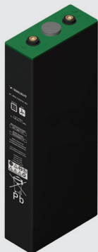
RES 3 SOPZV 425