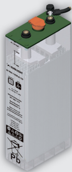
RES 4 SOPZS 720

Other sizes and series are available on request.